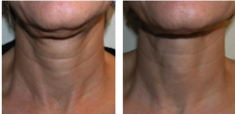
Before and 1 month post 3 treatment.